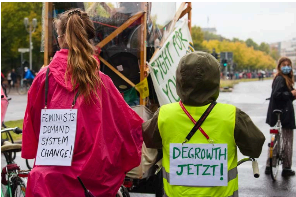
GenderCC team at the climate strike bike protest on 25.09.20 in Berlin, Germany.

Despite the lockdown and safety measures adopted throughout the world to fight the pandemic, 2020 has been an intense year of virtual and in-person social mobilisations against the interconnected crises we are living in. Always prizing for safety and care measures first, the GenderCC Secretariat participated in the #8M march in Berlin on March 8 th , joined the Fridays for Future global online climate strike on April 24 th and co-organised a queer and feminist bike protest during the Fridays for Future climate strike in Berlin on September 25 th . On this last one, 200,000 people took the streets throughout Germany and in more than 2.500 cities worldwide, protesting against the devastating consequences of climate change. Activists of diverse age groups and genders joined our bike protest in Berlin.